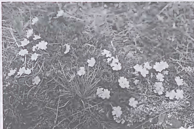
Figure 3. Hibbertia basaltica habit and habitat at Pontville, Tasmania.